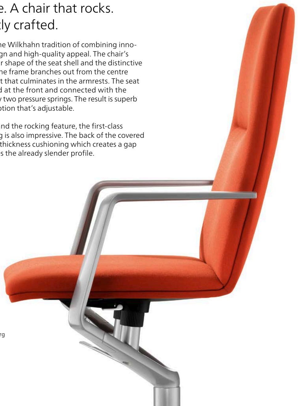
Sola Design: Justus Kolberg

In addition to the clear design and the rocking feature, the first-class craftsmanship of the cushioning is also impressive. The back of the covered plywood shell includes double-thickness cushioning which creates a gap all the way round. This enhances the already slender profile.