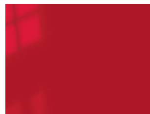
Lacquered glass Available in 11 standard colors