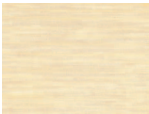
Natural birch veneer