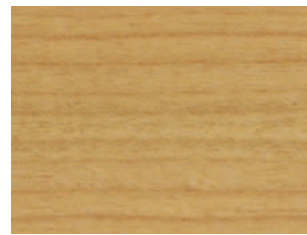
Natural cherry veneer