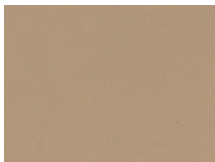
Beige table linoleum