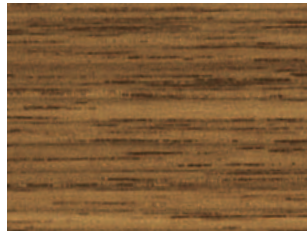
Natural walnut veneer