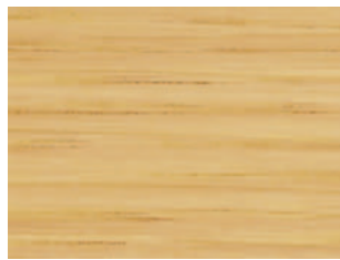
Natural oak veneer